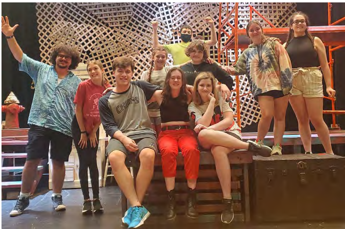
Summer Drama Program 2021, James and the Giant Peach

The summer drama program offers students of all ages the opportunity to take part in a theatrical production while learning the fundamentals of acting, singing, dancing, and theater tech from our highly qualified and passionate staff. All information for the 2022 program can be found on the drama website: cybdrama.weebly.com or Facebook at: Cortland Youth Bureau's Summer Drama Program.